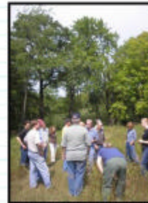
Forestry Workshop at St. John's