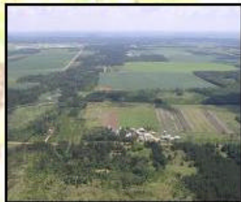
Bird's eye-view of West Central Landscape

The Landscape Program is looking to the public and private plan writers to assist private landowners in managing their woodlands in a way that contributes to the desired future conditions of the landscape regions where their forests grow.