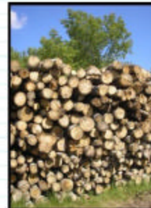
Timber Harvest in Todd County