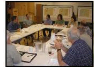
West Central Committee Meeting

In 1995, the Minnesota State Legislature passed the Sustainable Forest Resources Act. It formalized the state's commitment to a number of goals, including: Recognizing and considering forest resource issues, concerns, and impacts at the site and landscape levels.